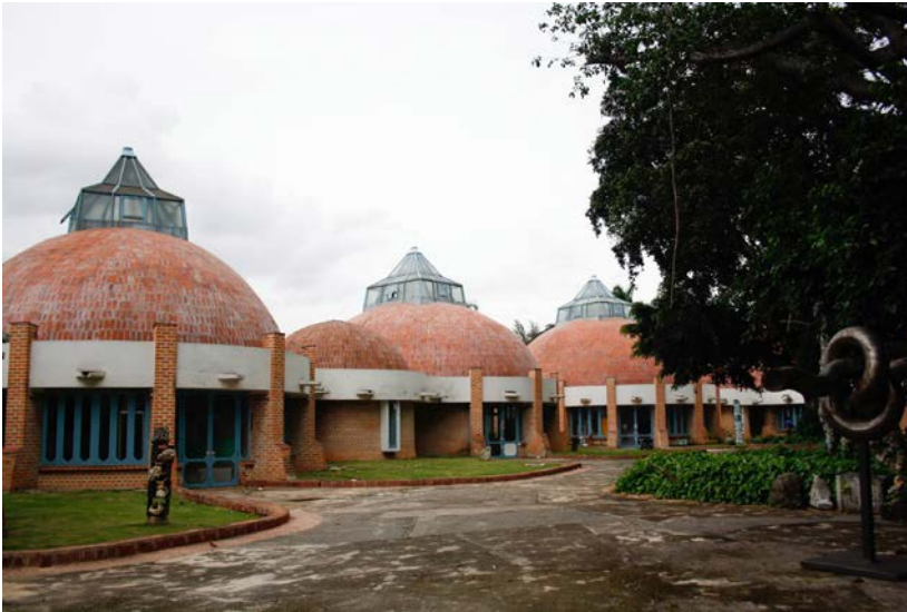
Instituto Superior de Arte