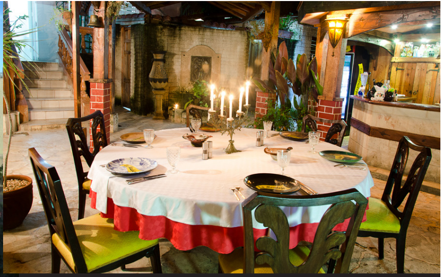
La Moraleja Paladar