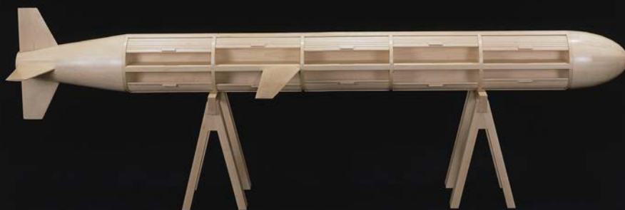
Los Carpinteros, Panera , 2004