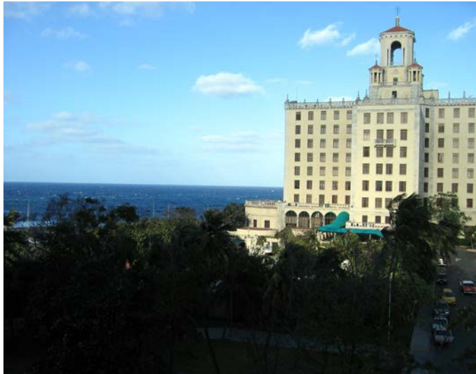
Hotel Nacional de Cuba

The culinary scene in Cuba has undergone a renaissance. Gone are the days of grim state-owned restaurants and their slim offerings. We will sample many of the beautiful, chic paladars (privately owned and operated eateries) that have sprouted all over the city, starring fresh fish and seafood caught in the island's waters.